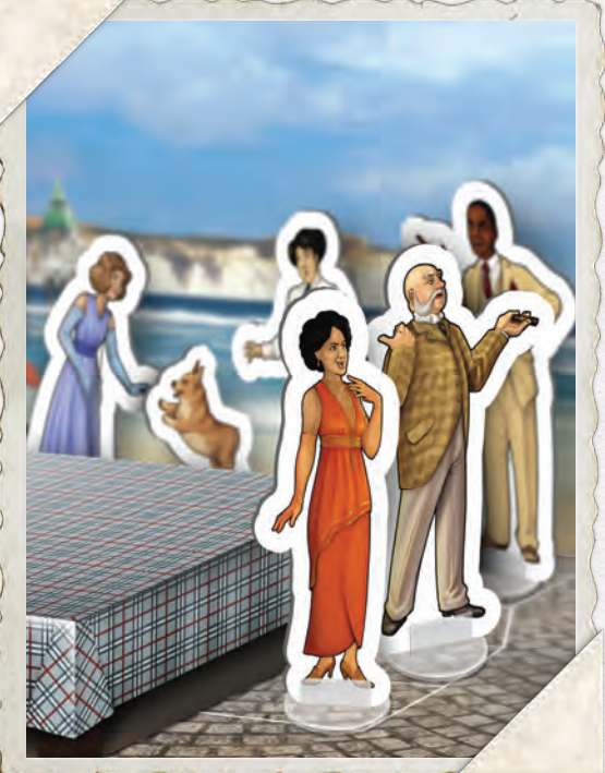
This could be your photo.

Once satisfied with their placement, each player will then take an actual photo of their play area using their cell phone camera. These photos will be used to calculate the player's scores based on how the guests are positioned in the photo (or if they're visible at all). Photos also have specific requirements (listed below) to be valid. If a photo